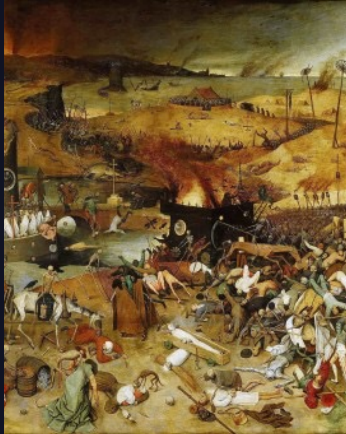
Pieter Bruegel the Elder, The Triumph of Death , c. 1562