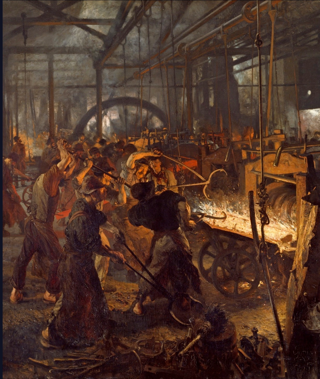
Adolph Menzel, The Iron Rolling Mill (Modern Cyclopes)